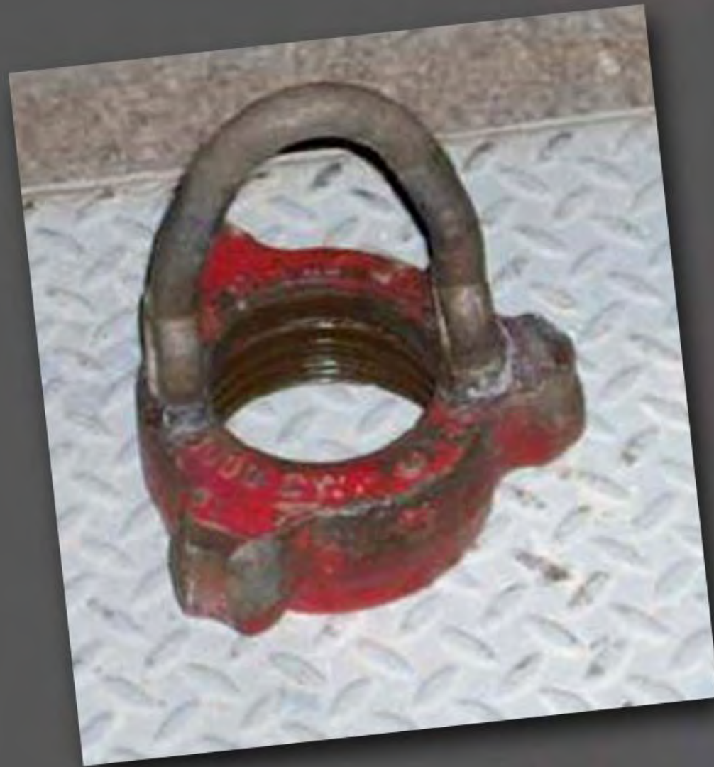
Homemade lifting device