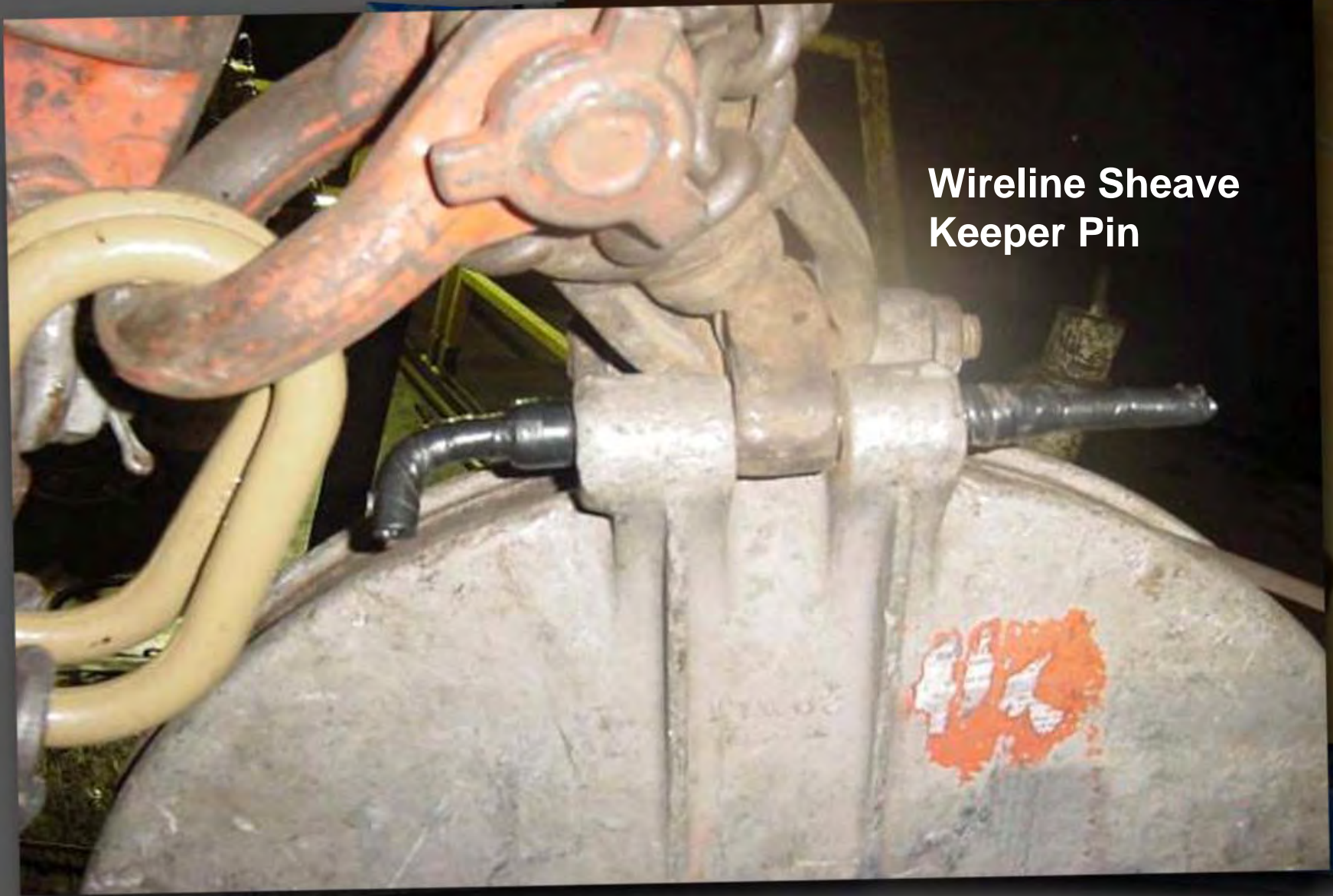
Wireline Sheave Keeper Pin

Checklists, spares, Third Party equipment