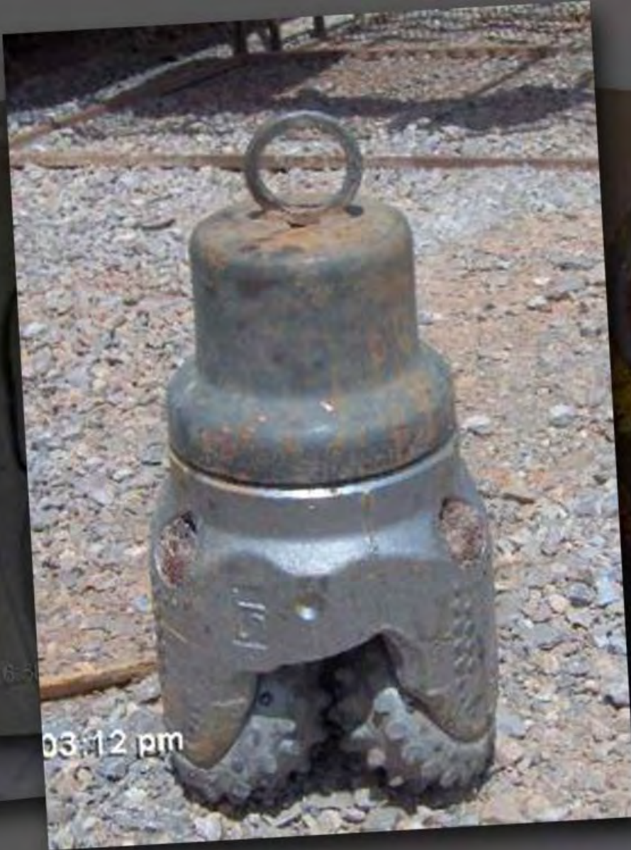
Homemade lift cap