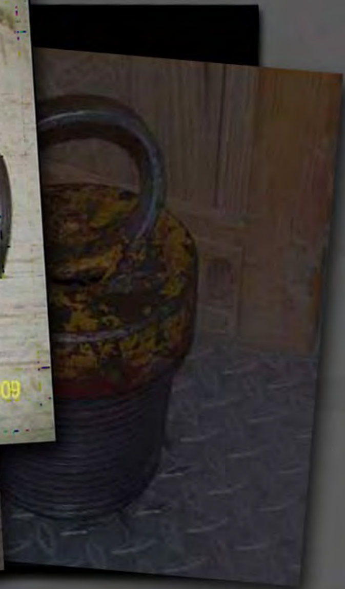
Rig fabricated, non-certified lifting device