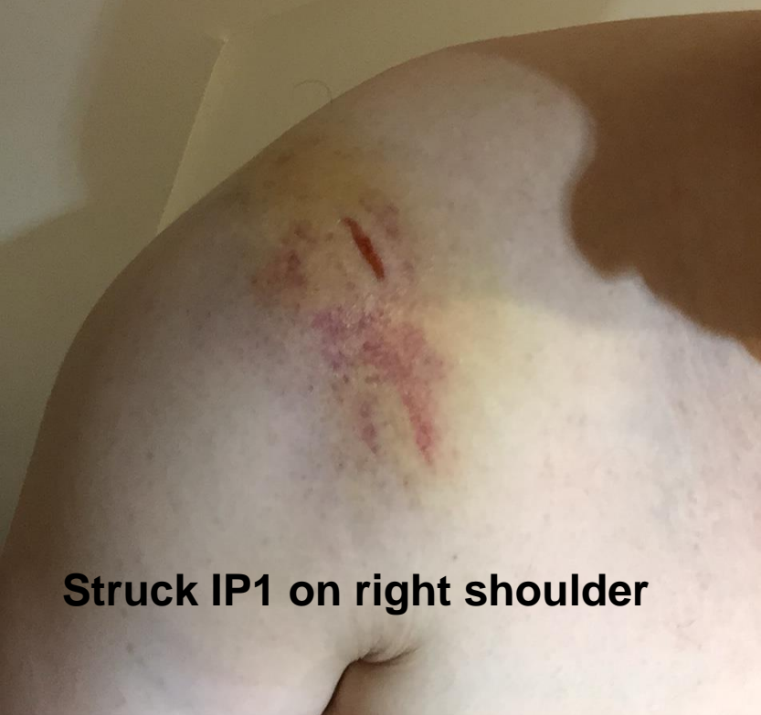
Struck IP1 on right shoulder