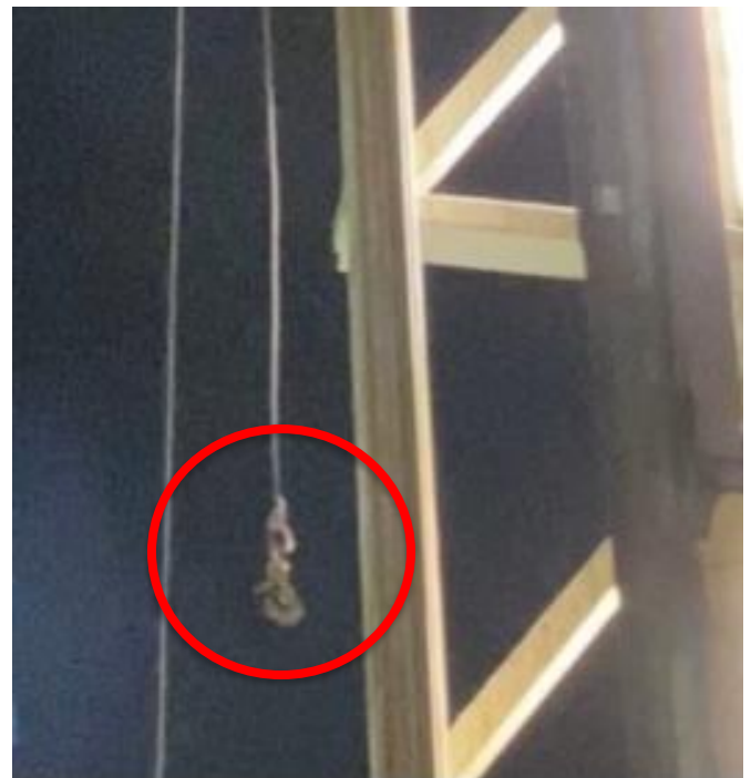
Post incident - safety hook was found open