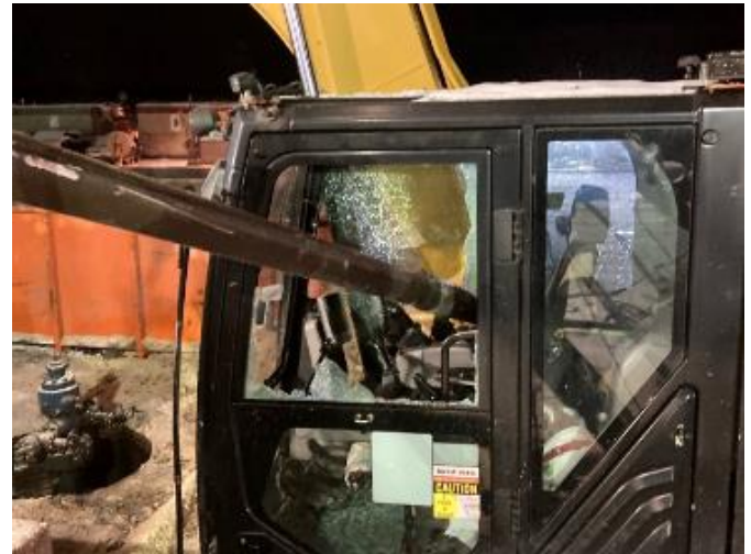
Final position of the HWDP