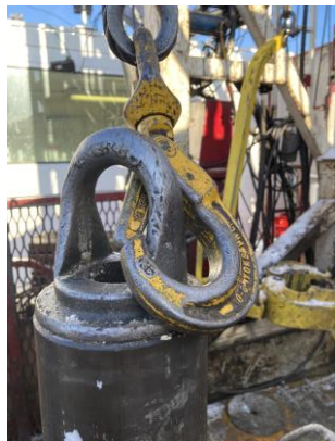
Functional diagram of a safety hook & the hook in use