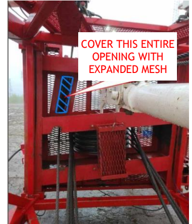
View of engineering guard to prevent improper spooling of drill line

Help industry by sharing lessons learned from an incident. Submit your Safety Alert.